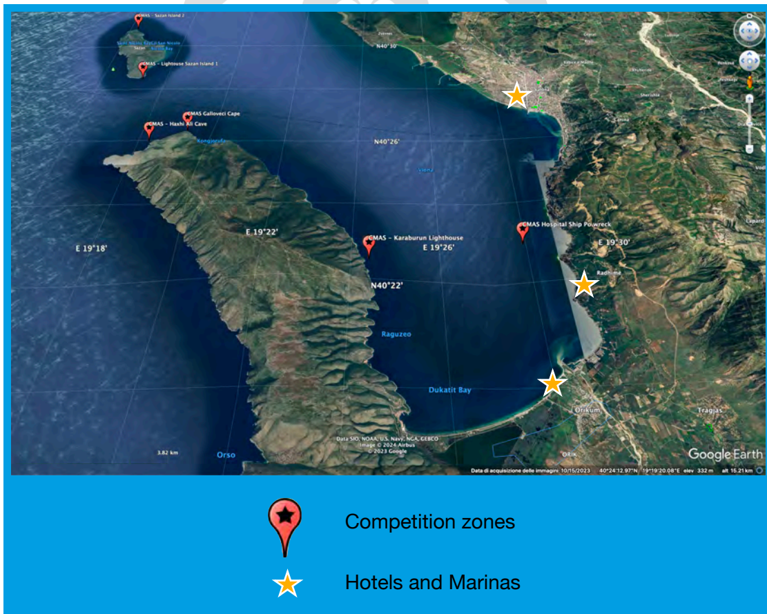
MAP 1 - Identification of the competition zones (both main, both reserve) - Vlora bay, Vlora (Albania)

3.7.The submitted photos and videos will be judged by the jury.