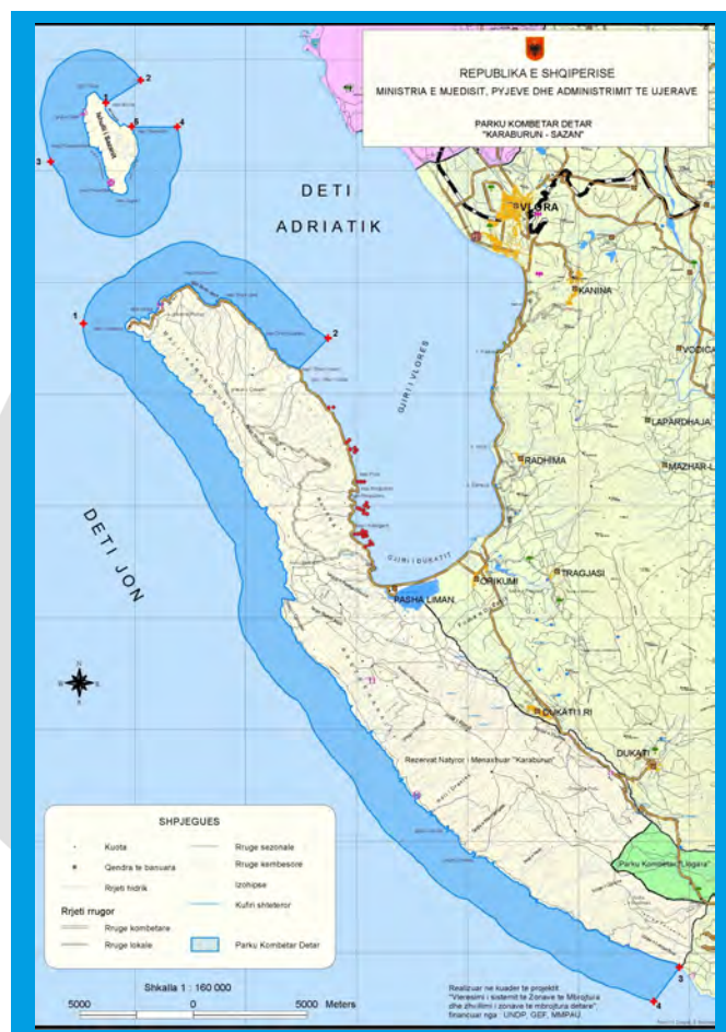
MAP2 - MAP of Marine Protected Area "Karaburun-Sazan - Vlorë bay

14.5. Regarding COVID, everyone has to follow the local Government rules that will apply. Nevertheless, the organization will provide a specific document for the event regarding the pandemic situation at the time.